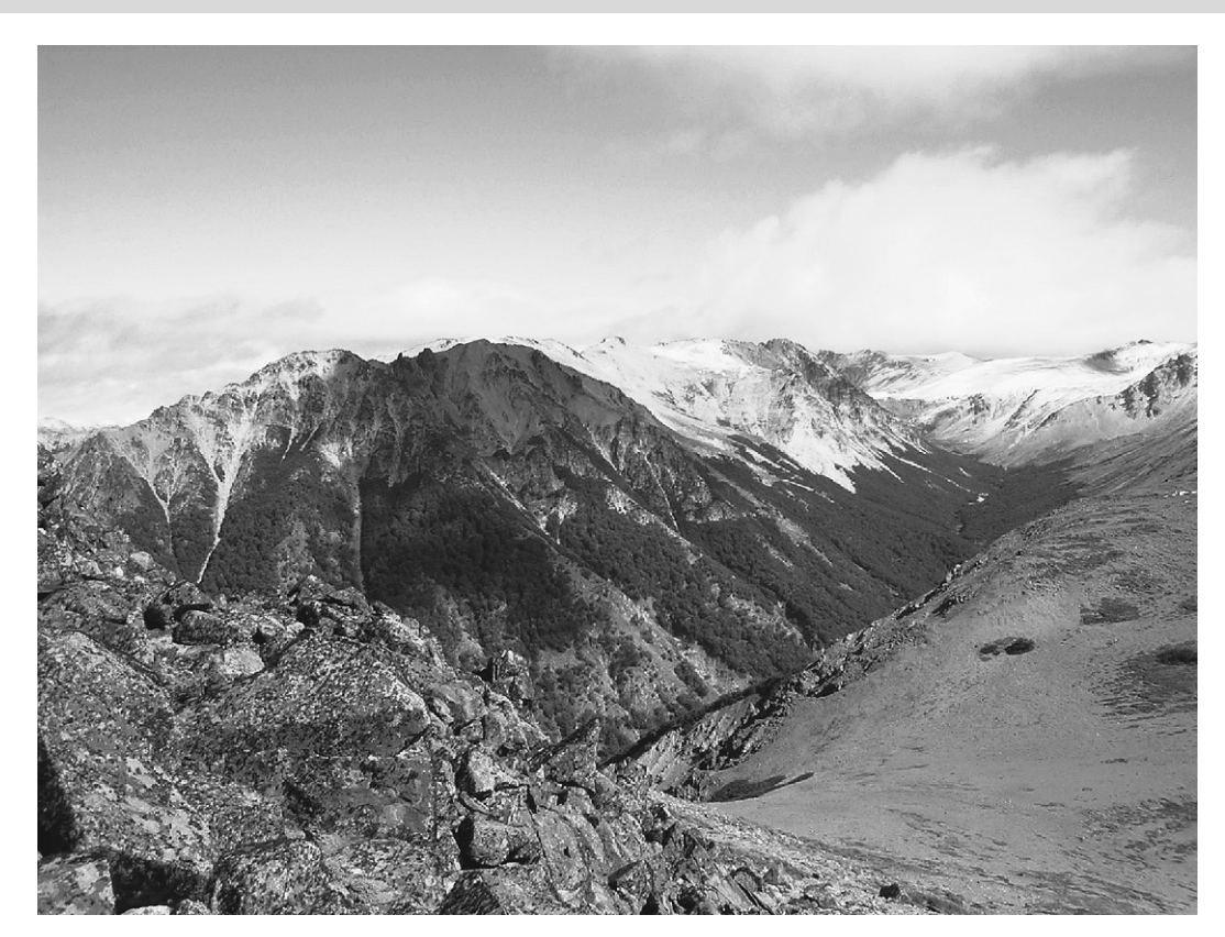
PLATE 1. Panoramic view of a temperate mountain region in northern Patagonia, showing an example of the kind of environmental changes that occur with altitude.

pattern that has a richness peak at intermediate altitudes with 25% or more species than at the base or top of the mountain (i.e., the so called "mid-elevation peak" by McCain 2009). A L-PL pattern had >300 m of consecutively high richness at the mountain base and thereafter decreasing species richness (see McCain 2009 for further details and other possible forms). Data sets that suggested no clear SRA relationship were assigned to NP, and other different forms were included in OTH.